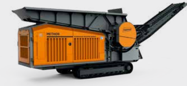
METHOR The 'multitool' among shredders offers the widest range of applications in its class.