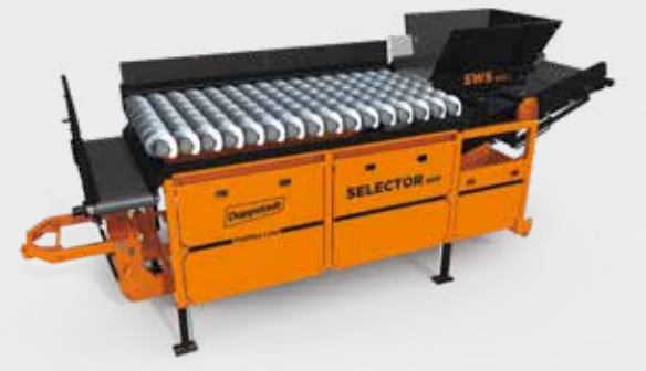
SELECTOR 400 Accurate and fast spiral shaft separation for even the most difficult material flows.