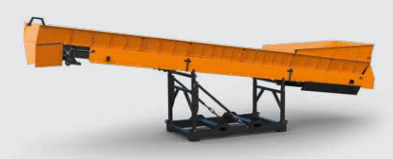
MOBILE AUXILIARY CONVEYOR DMB 8500